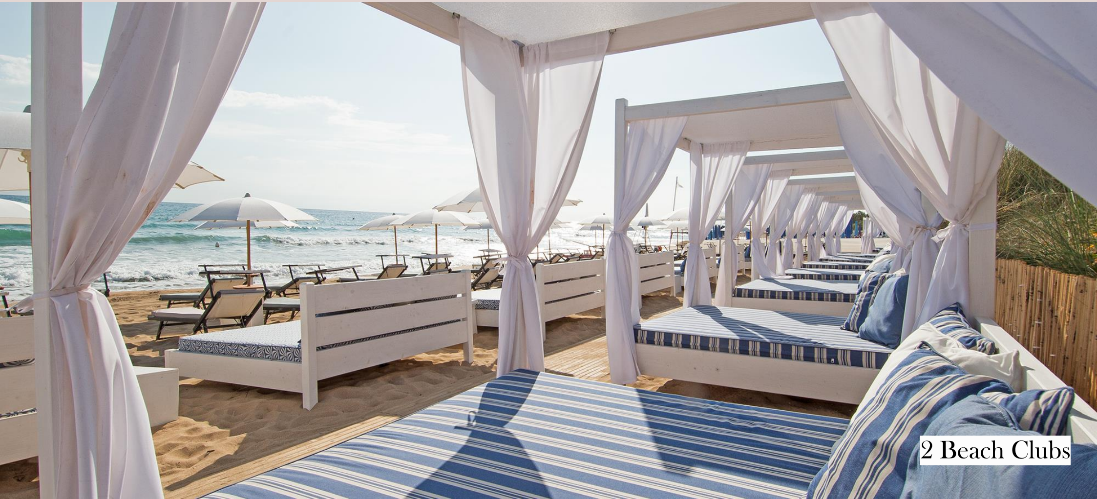
2 Beach Clubs